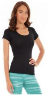
Desiree Fitness Tee

Customers can negotiate product price from product listing, product detail, wishlist, compare product list, related product and also from search page.