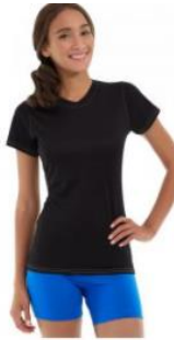
Gwyn Endurance Tee