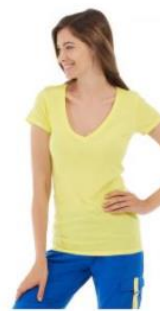
Diva Gym Tee